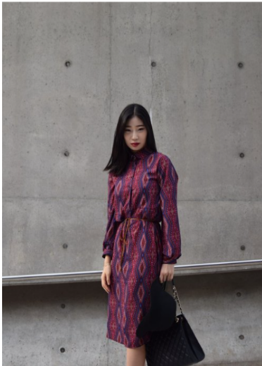
Eastern Plum Dress