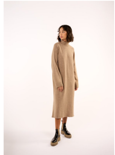
Tanner Sweater Dress

Classic knit, meet a flattering loose silhouette! This textured sweater dress is soft and snug with a mock neck neckline and lofty loose fit long sleeves. Team it with your favorite ankle booties for a fabulously on-trend look!